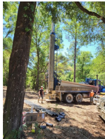
Well being drilled