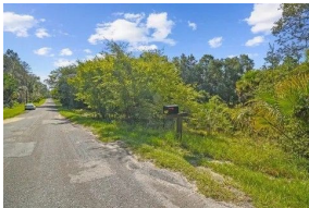
Road in front of property

The Sweeney family (plus 2 pit bulls) have been living in a 400 sq. ft. 5th wheel RV for the last year. 1.8 acres has been purchased to build an 1,800 sq. ft. 3 bedroom 2 bath home on. A 160' well has been dug, the septic will be installed shortly, and we are expecting the building permit approval any day. This is an owner build. Please pray things go smoothly as this is a new endeavor. Thanks.