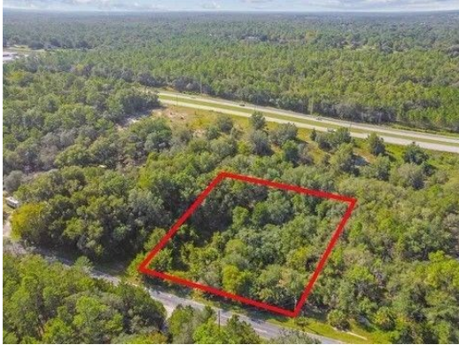
Aerial view of the property