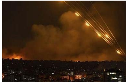
IRANIAN MISSILE ATTACK ON ISRAEL